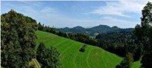
left and right of beautiful Tösstal