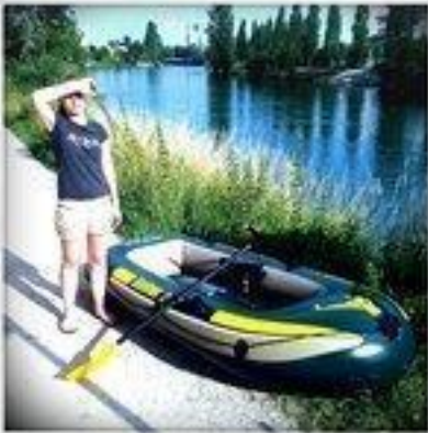
I christen you Seahawk II