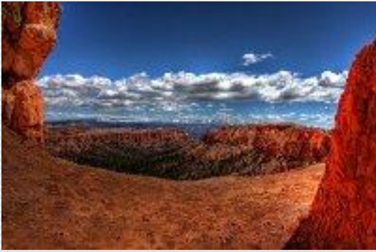
Pix from my last trip to NV, UT and AZ