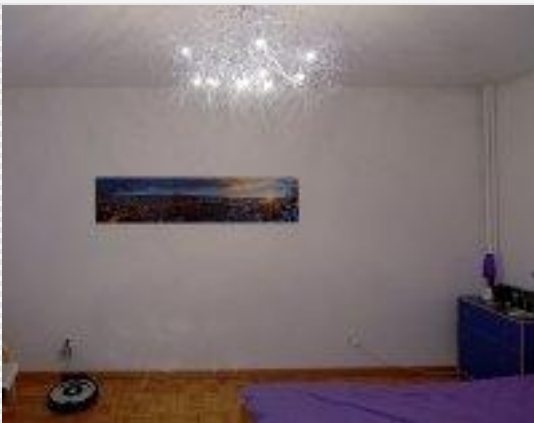
160x40 cm 2 acrylic dibond print of my Mono Lake panorama